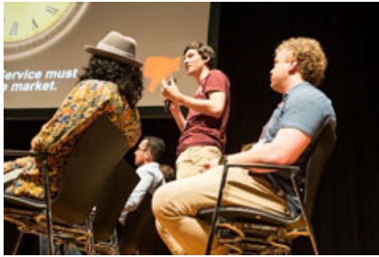
House of Commons debate

Also new were the Pressure Cooker sessions in which mobility students were brainstorming on solutions for the various mobility cases submitted by cities and regions like Rome, Kassel, Groningen and Limburg.