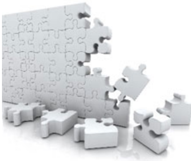
Designed by Freepik

With a focus on sharing knowledge and encouraging further cooperation in order to jointly address the various mobility challenges, the ECOMM 2017 was built around five crosscutting subjects.