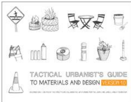
Tactical Urbanist's Guide to Materials and Design, 2016

Over the past decade Tactical Urbanism has become an international movement, bringing about a profound shift in how communities think about project development and delivery. See this attractive video with examples from Boston, Vancouver, Rotterdam and more.