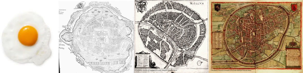
Fried Egg, ancient Mexico City, Moscow, Brussels