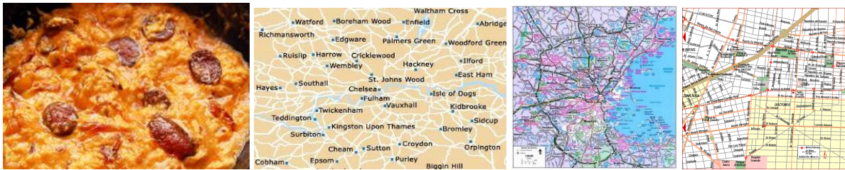
Scrambled Egg, recent London, Boston, Mexico City