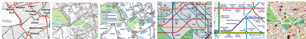
Different layers of a city: coach-, bus-, night bus-, bike path-, tube-, and street network (London)

Key factor for (European) development: DENSITY of knowledge, experience, possibilities, amenities, networks, hubs... ..and that is what we call: CITY!