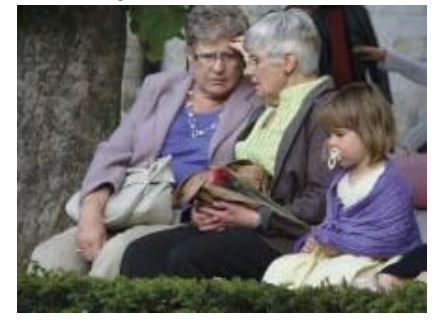
Elderly and child