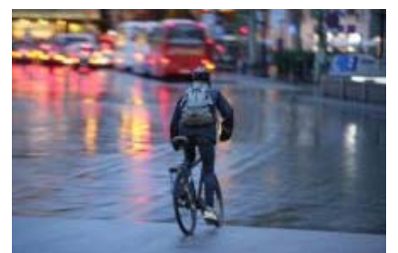
Cycling to work